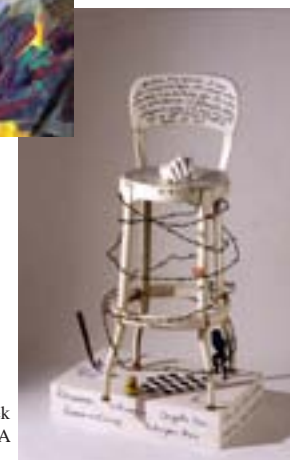
Rosa Naparstek USA