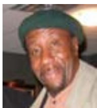
Ademola Olugebefola NGO Representative to the United Nations