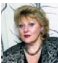
Sherrill Kazan President, World Council of Peoples for the United Nations